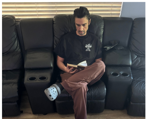
Spending time in The Word