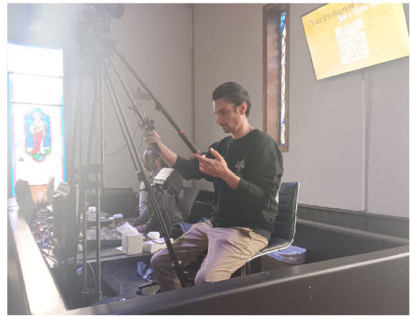
Volunteer Video Operator for Venice Church