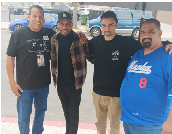
Enjoying friendships at church